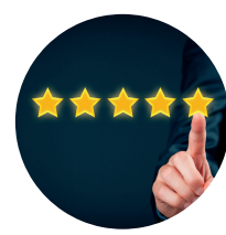
Get live feedback

The NBCDA Conference is committed to representing members and the career development community. NBCDA fosters partnerships with diverse national, provincial and local organizations and governments with an interest in the areas of career development and life/work transitions.